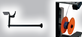
WIRE ROLL HOLDER Prod.-No. 031001-002