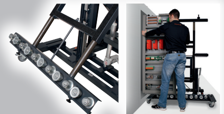
ROLLER CONVEYOR for the insertion of the mounting plate into the control cabinet from the side Prod.-No. 031001-004