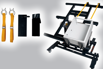
CONTROL CABINET SET Prod.-No. 03100-005